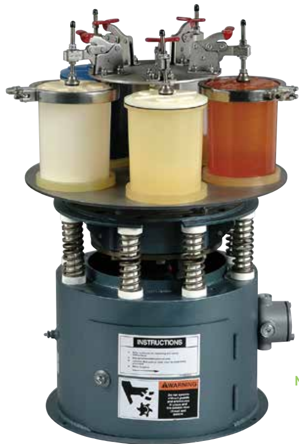
M18-5 GRINDING MILL

Fast, low-cost particle size reduction to submicron range