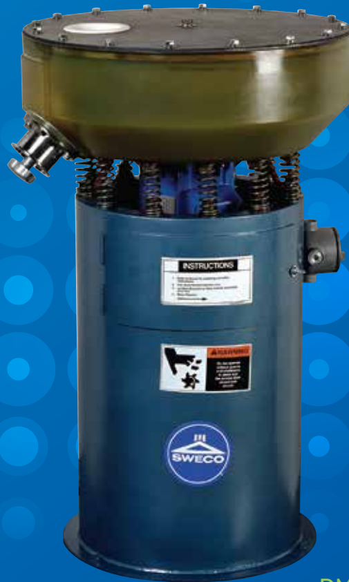
DM1 GRINDING MILL

THE MOST VERSATILE LINE OF WET OR DRY GRINDING MILLS FOR SIZE REDUCTION OF GRANULAR MATERIALS TO SUBMICRON PARTICLE RANGE